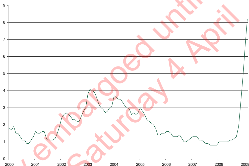
Chart 1: Registered unemployment rate in Iceland

7. In June 2007, an International Monetary Fund (IMF) report concluded that “The medium-term prospects for the Icelandic economy remain enviable”. 3 However, the same report sounded a cautionary note, highlighting “Iceland’s large current account deficits, the rapid growth in indebtedness, and persistently high consumer price inflation”. 4 Other economic indicators also suggested Iceland’s economy was doing well around this time. Iceland’s 2007 GDP per capita was US$ 37,700, which compared favourably with other European countries and was above the OECD average; as Chart 1 shows, unemployment was also low. 5