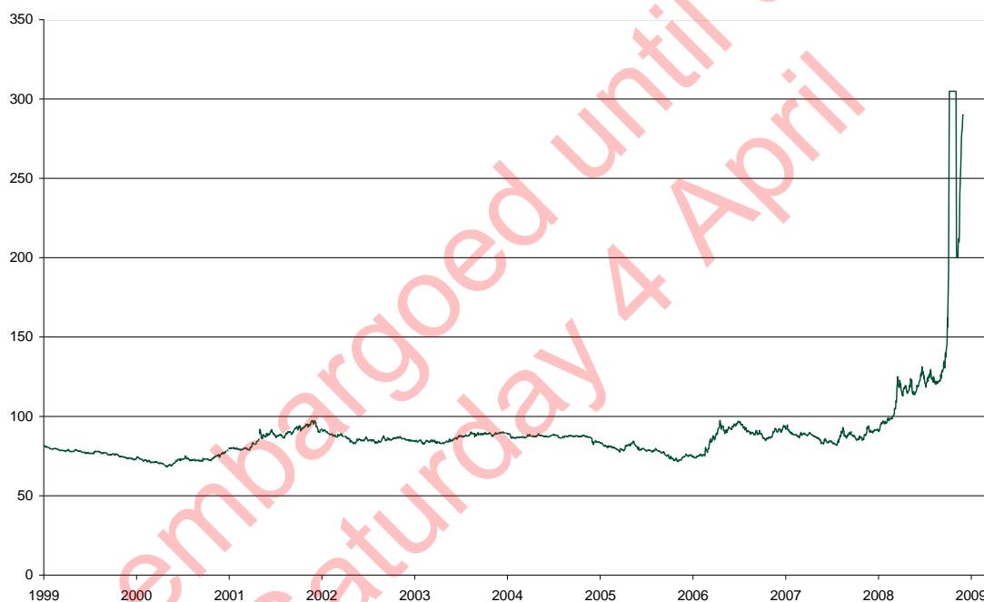
Chart 2: The exchange rate between the Icelandic Króna and the Euro (Króna/Euro)

9. By the end of 2008, the economic position of Iceland had considerably deteriorated. Chart 1 shows how unemployment rose markedly towards the end of 2008 and into 2009. In February 2009, registered unemployment in Iceland was 8.2%. This compares with August 2007, where registered unemployment was 0.9%. 8 Chart 2 highlights another sign of this new weakness in the economy, as the Icelandic Króna suffered a significant fall in value against the Euro. This weakness started in early 2008 but increased in severity as the year progressed.