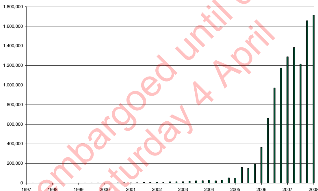
Chart 4: Foreign deposits at Deposit money banks (Millions Króna)

source of funding for two of the banks, particularly in 2007 and early 2008. But the bond markets remained virtually closed to them as the year 2008 progressed.” 31 Despite the closure of the bond markets to the Icelandic banks, their management remained confident of the supply of funding via deposits. Ingimundur Fridriksson reported that the Icelandic banks “were so confident about their success that, at meetings held over the course of 2008, some of their leaders voiced the expectation that it should be easy for them to fund all of their outstanding bonds and other debt for the coming years through deposit business in Europe”. 32 Dr Jon Daniellson of the LSE told us that “the reason why these [Icelandic] banks came to this country [the UK] was because they could not borrow elsewhere, they could not borrow from other banks”. 33